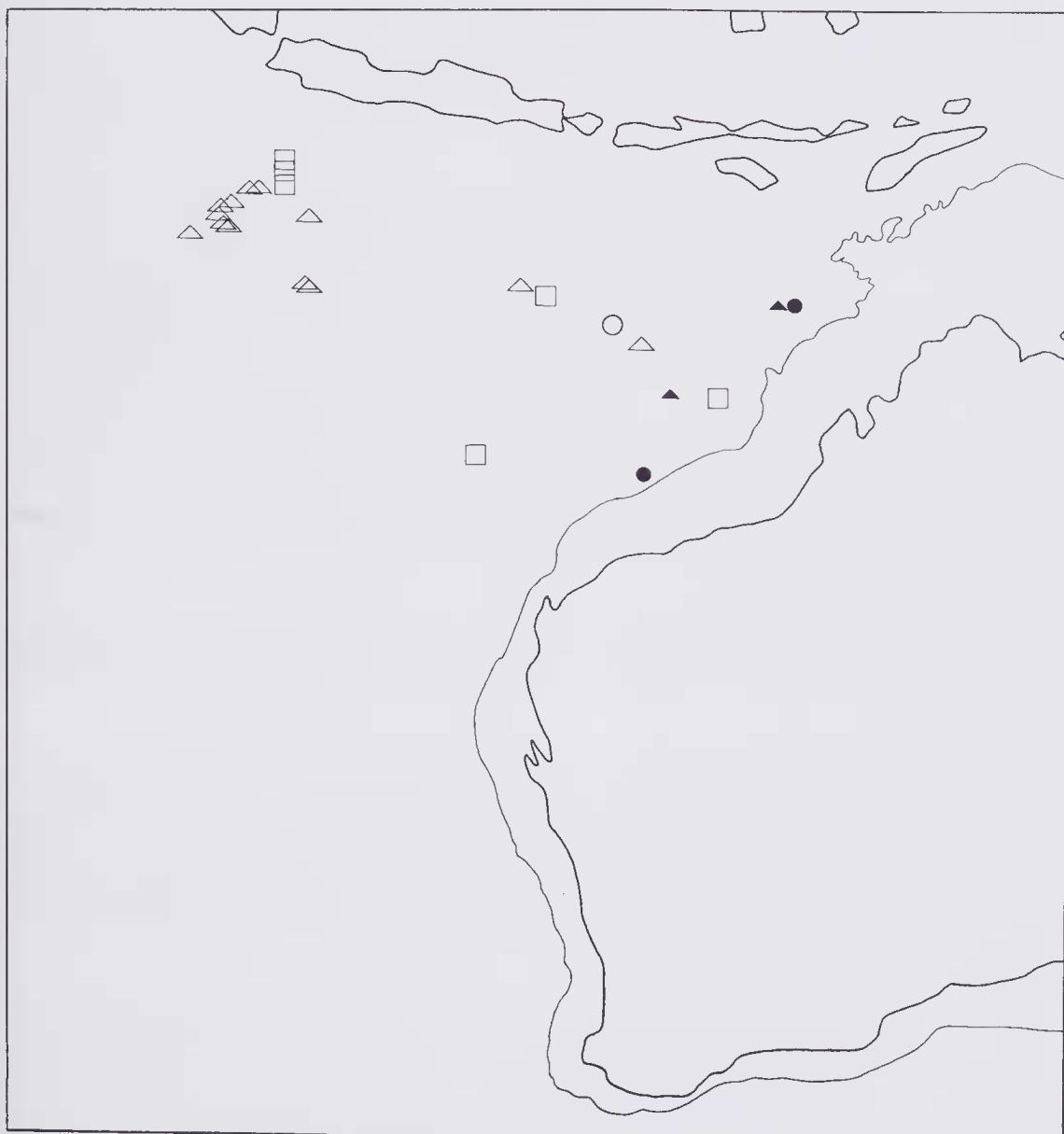
Figure 2 The localities at which Phaethon lepturus fulvus , P. lepturus and P. rubricauda were recorded during the present survey. Also presented are the localities at which P. lepturus and P. lepturus fulvus were noted by Pocklington (1967). Each symbol indicates an independent sighting of one, or a number, of individuals.

▲ (Pocklington 1967) ● (Pocklington 1967)